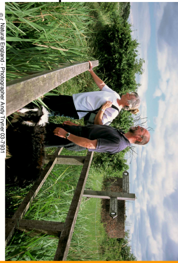
© Natural England - Photographer Andy Turner 03-7631

A diverse walk. The spectacular views from the inland section make the road walking more than worth the effort. The boardwalk is an adventure itself!